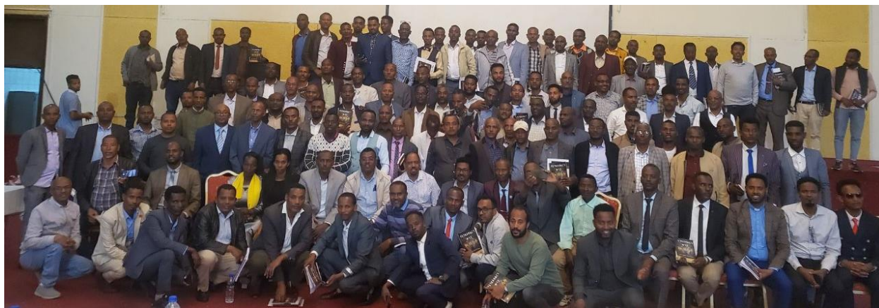
Photo: Participants of Pastors' Training

MKC Newsletter was published quarterly by the Office of the President of MKC for free distribution to MKC members, friends, and partners. Send questions or comments. Mkcho.pr@gmail.com