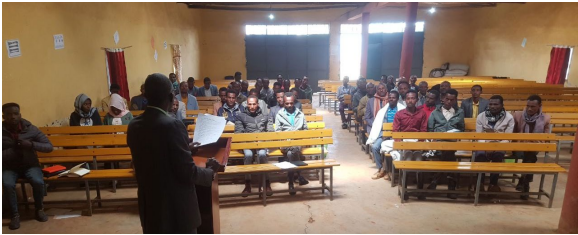
Meta Sheno Region