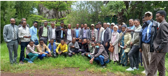
Southwestern Shewa Region