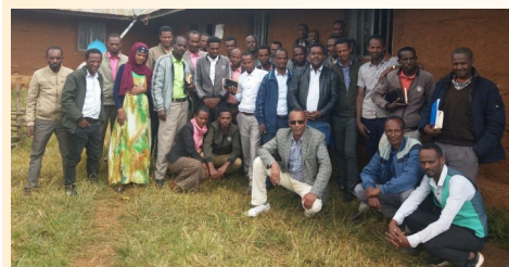
Training participants—Jarte MKC Region

The mission has trained 30 and 25 church planting workers on "Christ-centered life and ministry in Jarte and Shambu Regional Offices respectively.