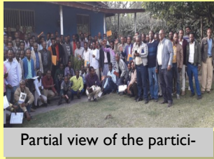
Partial view of the partici-